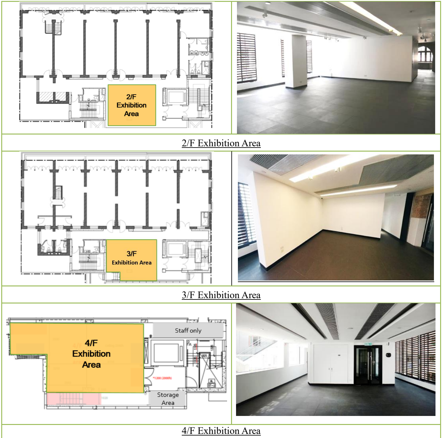
2/F Exhibition Area